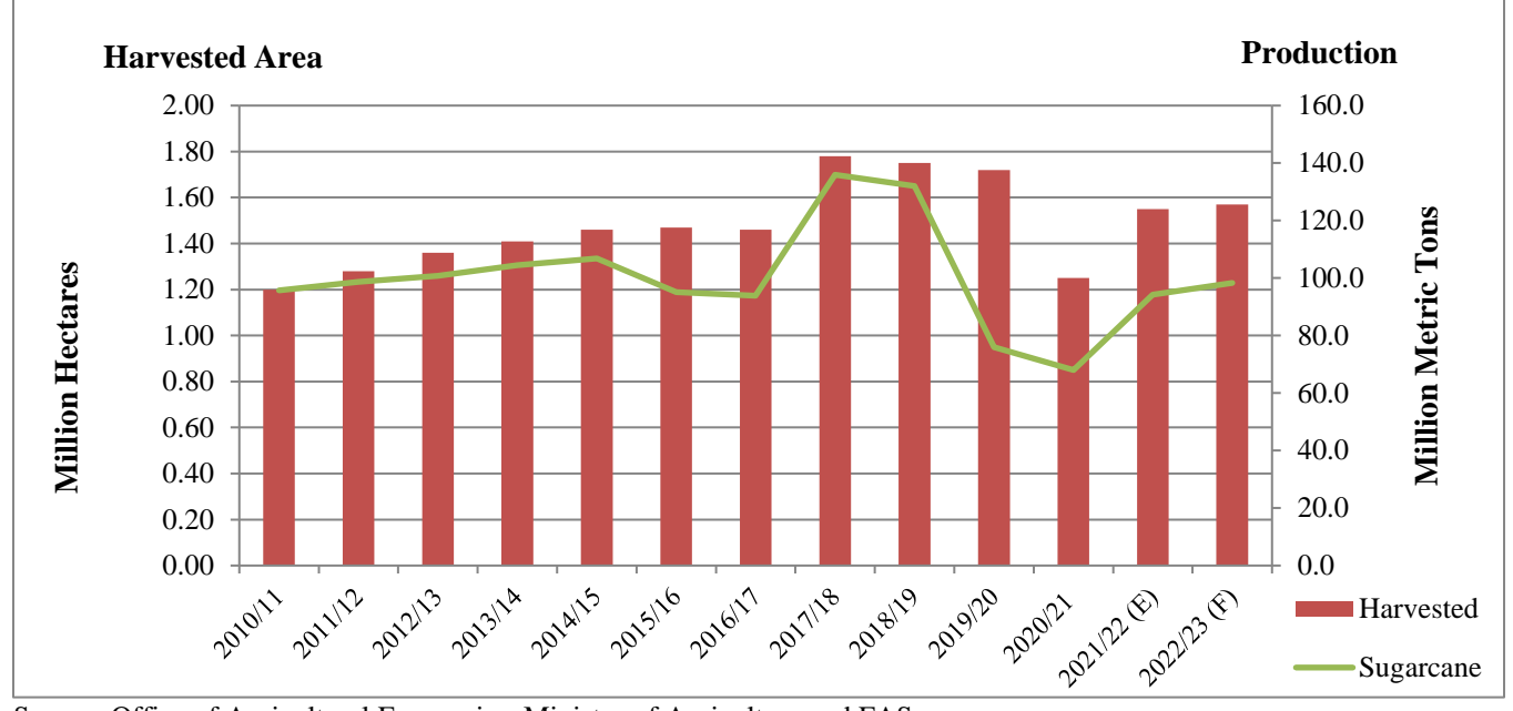
Figure 1.1: Thailand's Sugarcane Planting Area and Production